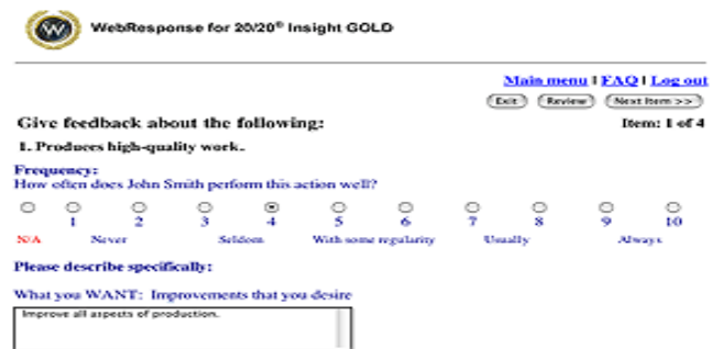
Figure 3. – Insight 20/20 GOLD Interface [6]

In each of the examples we looked at, a mixture of quantitative and qualitative feedback were the primary means of comparative rating for the employee. The numerical system varied from four to ten options, as did the definition behind the rating scale.